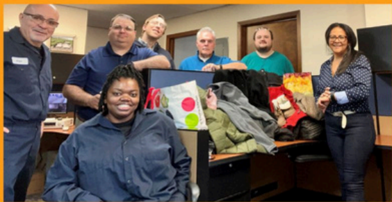
Succeeding Together as One Team