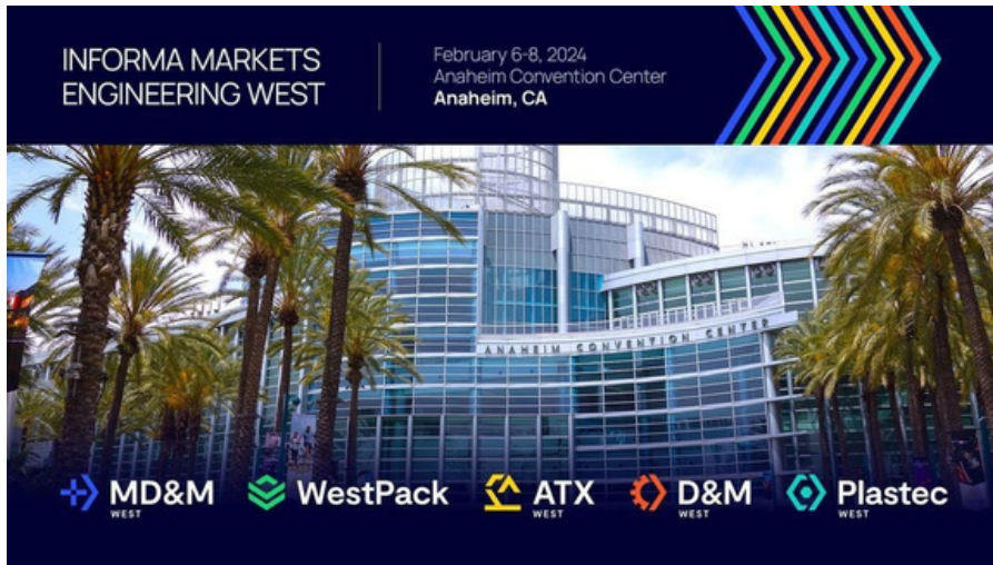
Photo Caption: Chroma Color exhibits at MD&M, WestPack and Plastec

Participate in key industry events to provide details on our own sustainability efforts to influence others in the plastics industry to establish their own programs.